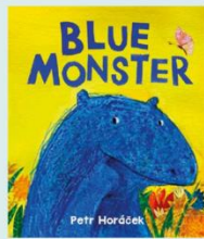
Blue Monster by Petr Horáček (Otter-Barry Books, 2024)