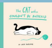
The Cat Who Couldn't Be Bothered by Jack Kurland (Quarto Publishing PLC, 2024)